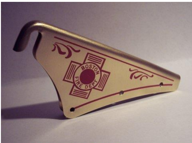
Flat Top Holder, Boston Style Logo Item #9011

Customized holders can be personalized with any text you would like to add to the middle of the logo. We offer the flat-top style holder for newer model Cairns® helmets as well as the arch top style used in older helmets. Mounting hardware is included. (Note that arch top holders require custom trimming to ensure proper fit on most Cairns® traditional helmets)