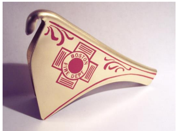
Curved Top Holder, Boston Style Logo Item #9012